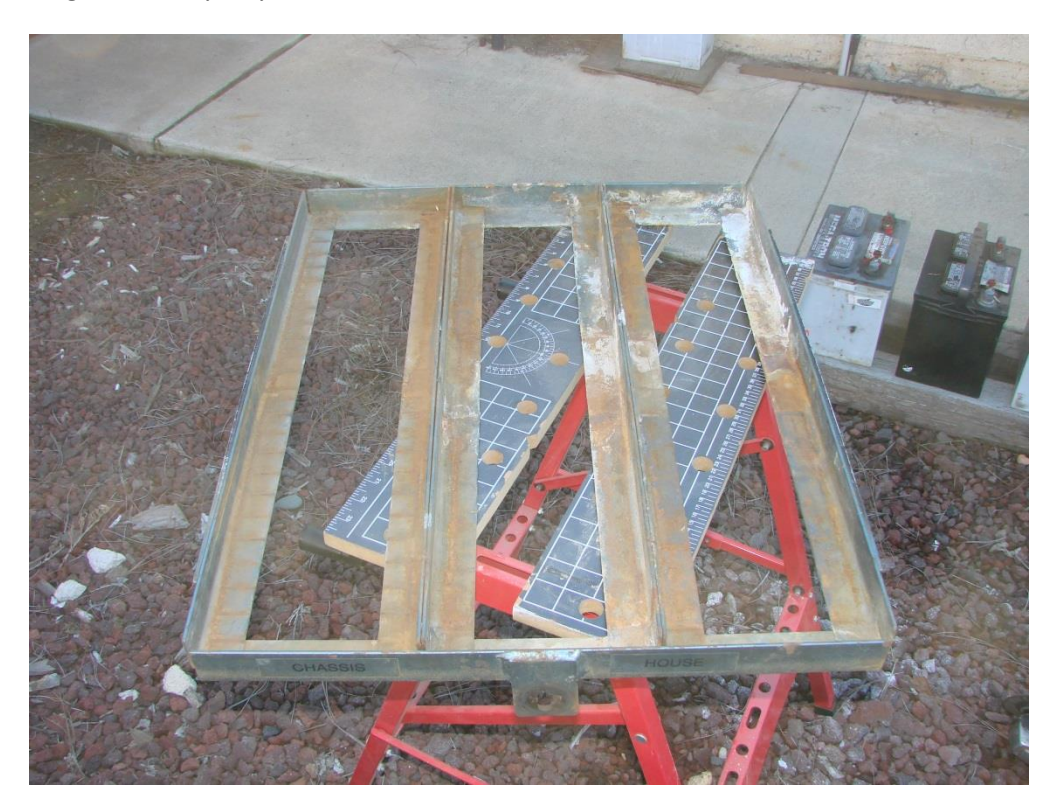
Revised tray showing extension with cables